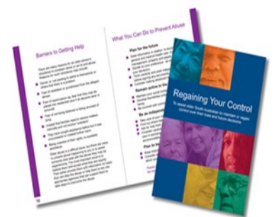
Regaining Your Control booklet