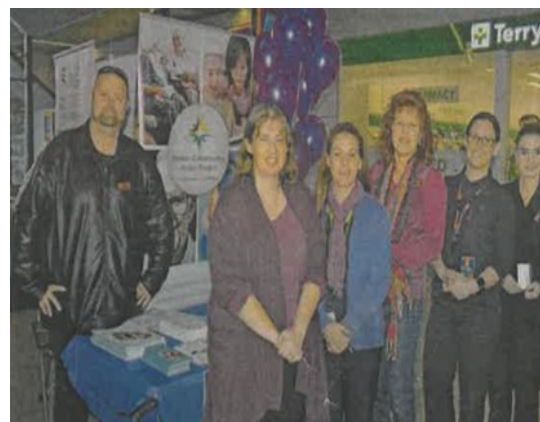
Raising awareness of elder abuse at a 'Pop up Expo' at Co-op Shopping Centre, Nurootpa –

Barossa Village, Country Home Services, The Barossa Council