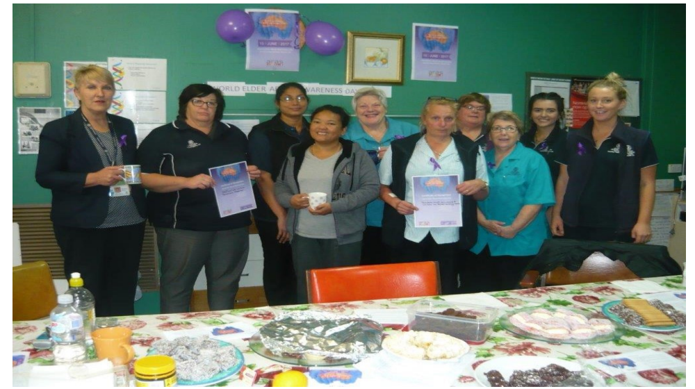
WEAAD display – Ira Parker Nursing Home and Balaklava Hospital