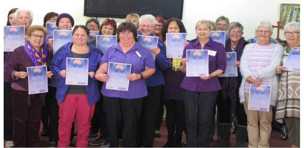
WEAAD display – Moonta Health & Aged Care