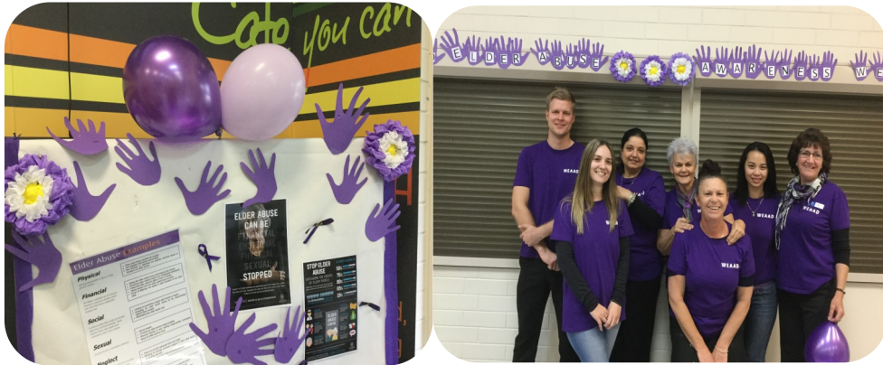
WEAAD display and staff – Jack Young Centre