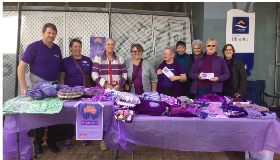
WEAAD display and staff – Len Beadell Library